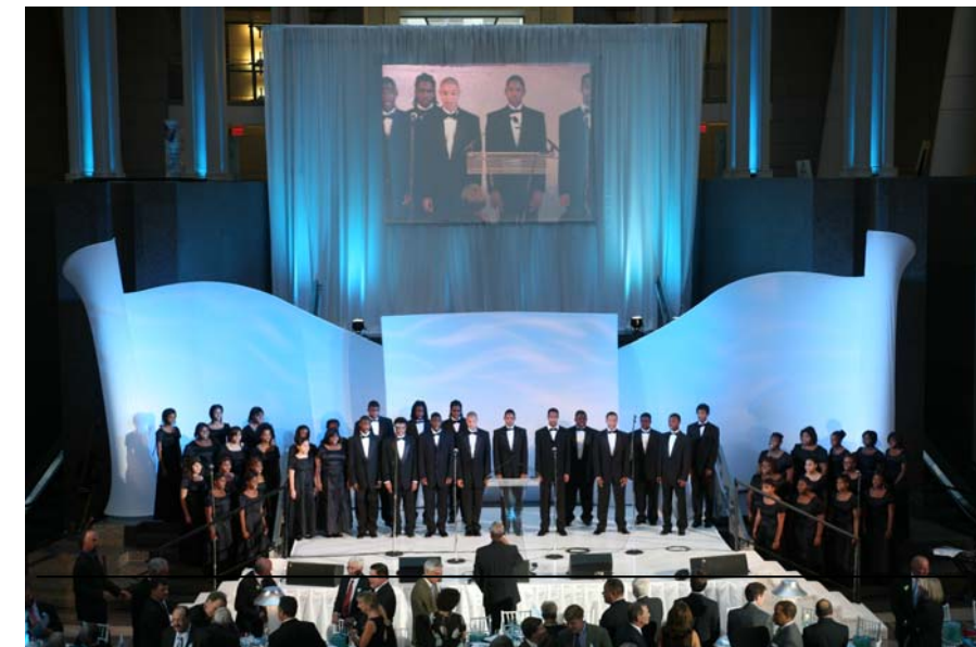
The inaugural Clean Water America Gala – Clean & Safe Water for Future Generations , held on Sept. 18, 2007 in Washington, D.C., celebrated achievements in the clean and safe water arena.

The inaugural Clean Water America Gala – Clean & Safe Water for Future Generations , held on Sept. 18, 2007 in Washington, D.C., was a huge success. NACWA took the lead in organizing the Gala, which was attended by approximately 450 people and provided a unique opportunity for organizations to spotlight their support for clean and safe water. With the 35th anniversary of the Clean Water Act as a backdrop, the Clean Water America Gala served not only as a celebration of the tremendous record of achievement in the clean and safe water arena, but also as the launching point for new, robust, and collaborative alliances between all clean and safe water stakeholders to address the daunting challenges of the 21 st century.