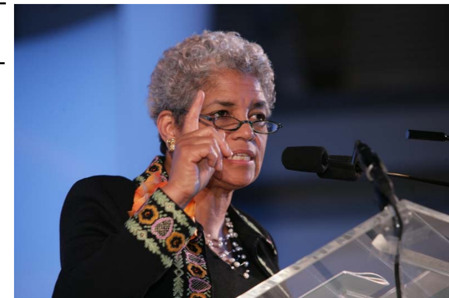
Atlanta Mayor Shirley Franklin delivered a rousing keynote address.

This was a spectacular evening for those in attendance and set the stage for ongoing clean and safe water progress. The event also brought together a diverse group of association and industry leaders whose collaboration will be essential to achieving the common goal of sustainable clean and safe water for future generations.