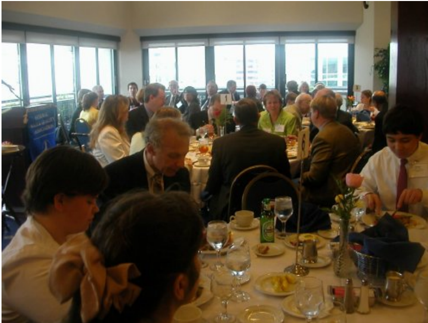
A good number of members and students attended the luncheon at the National Press Club on May 25 th to honor the 2006 winners of the FWQA Scholarships. Congratulations to all of the winners – the future is waiting for you!